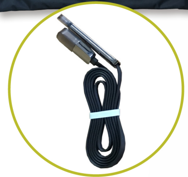
Optional: a 1-meter USB cable with double output: micro USB/ lightning.